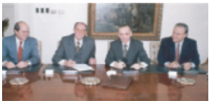
Representatives of Banco Santander Chile and CGE.

Banefe, for the second year in a row, sponsored the Women Micro-Entrepreneur Of The Year Award. This year's winner is an artisan who creates and sells artifacts with Chilean cultural motifs. The organization of this prize is congruent with Banefe's strategy to increase lending to these emerging segments and a recognition to the role of women in the workforce.